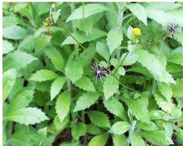
Young green leaves, yellow flowers and hooked seeds of Cobbler's Pegs.